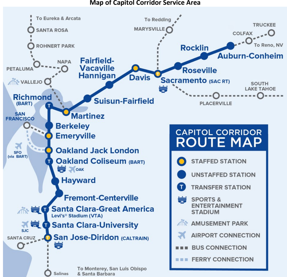
Figure 1-1 Map of Capitol Corridor Service Area