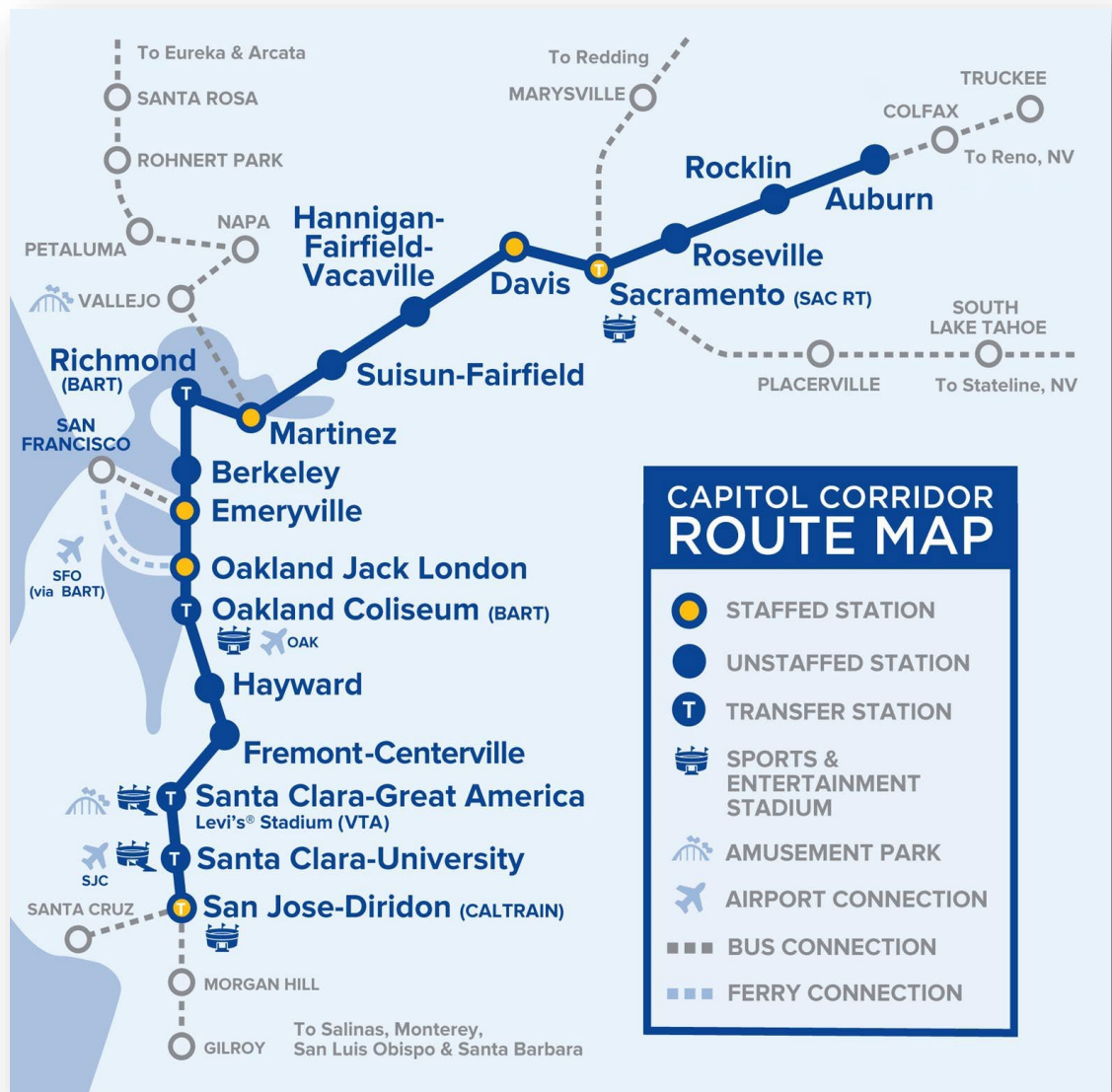
Figure 1-1 Map of Capitol Corridor Service Area