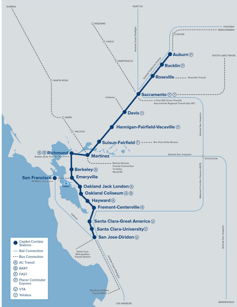
Figure 3-1: Connecting Bus, Transit, and Train Services

In FY 2020-21, CCJPA will partner with Amtrak on additional security patrols and increased frequency of deep cleaning at select East Bay stations.